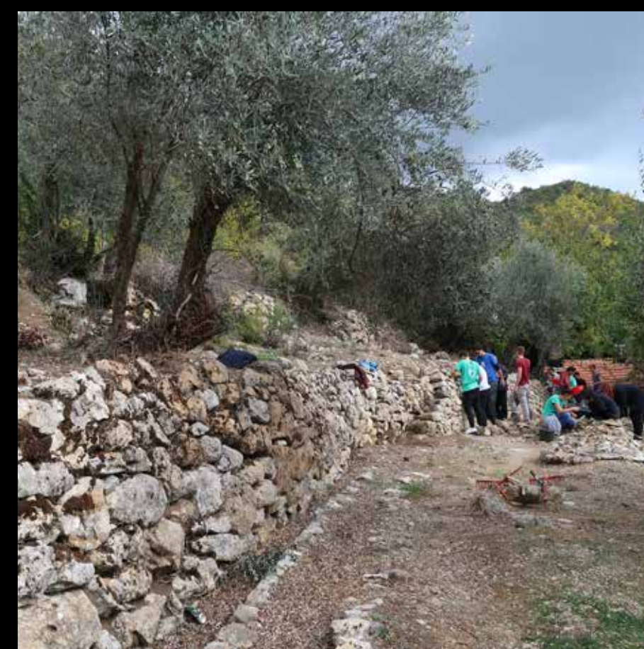
10 - Activities of restoring dry-stone walls - retaining walls of olive groves, Gorinji Lastva