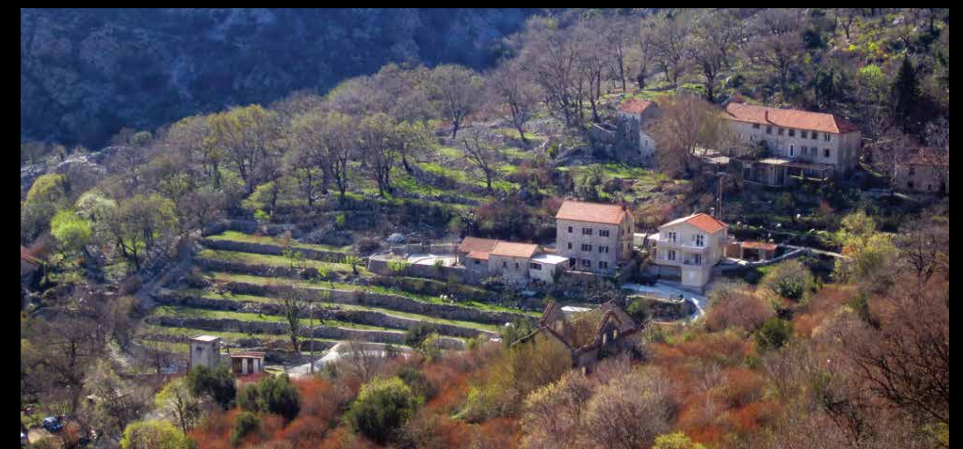
11 - A traditional group of houses with the preserved terraced fields, Mala, Risan