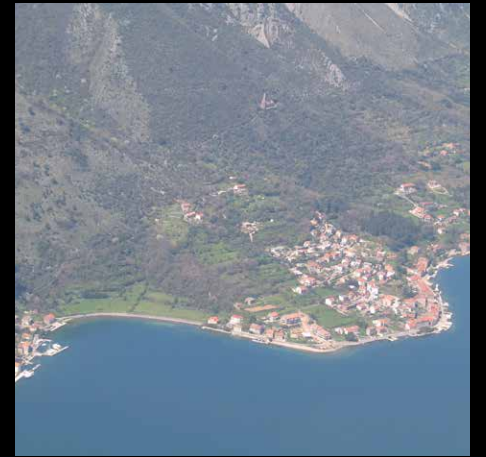
3 - Transformation of terraced fields and preserved fields at Glavati cove, Prčanj