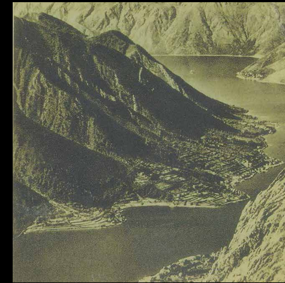
2 - Arable terraced fields above Prčanj, a photograph from the beginning of the 20th century