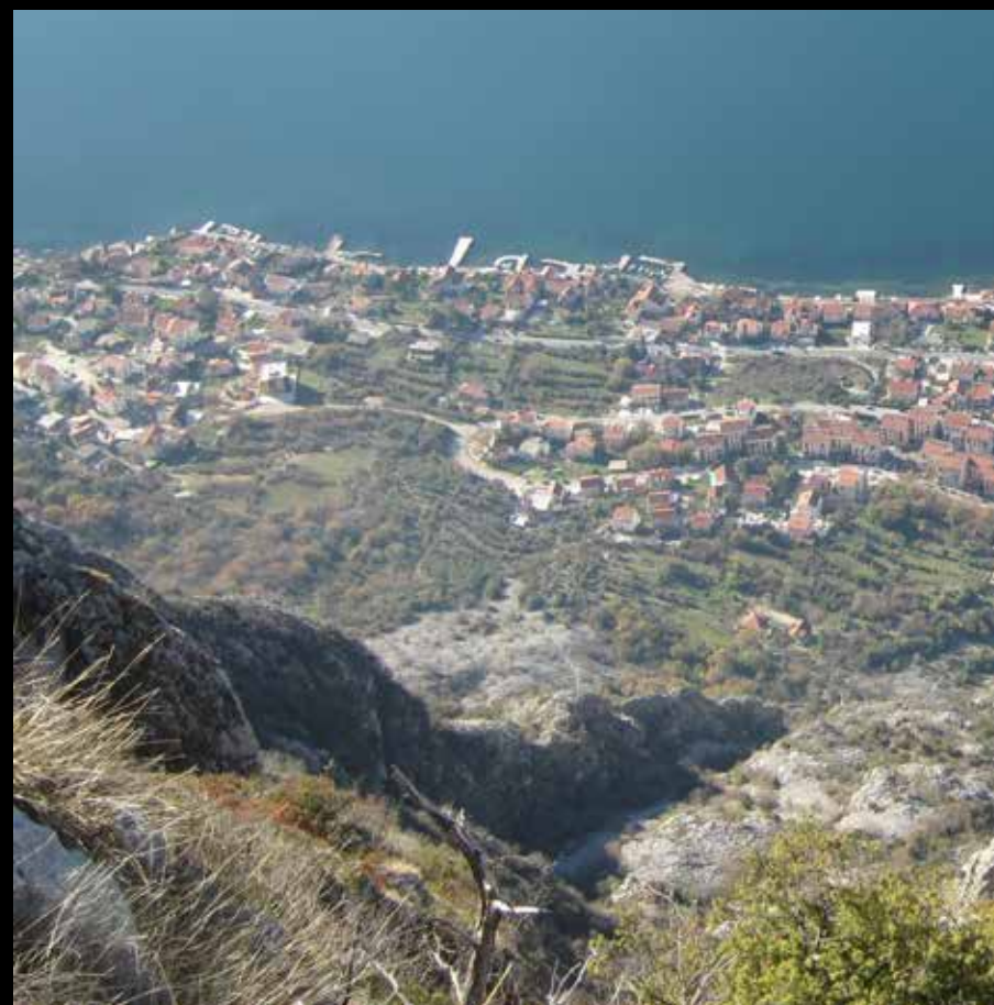
5 - The process of urbanization of zones with the remains of terraced fields, Dobrota