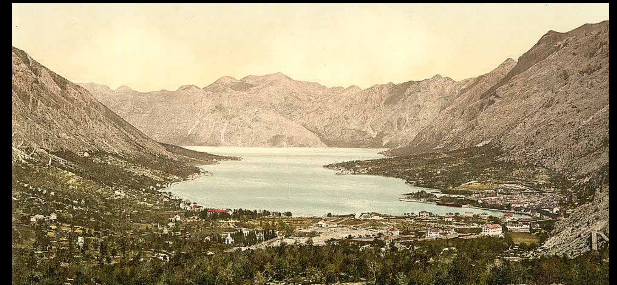
1 - Kotor part of the Bay with arable hillside fields, the beginning of the 20th century

Text: EXPEDITIO