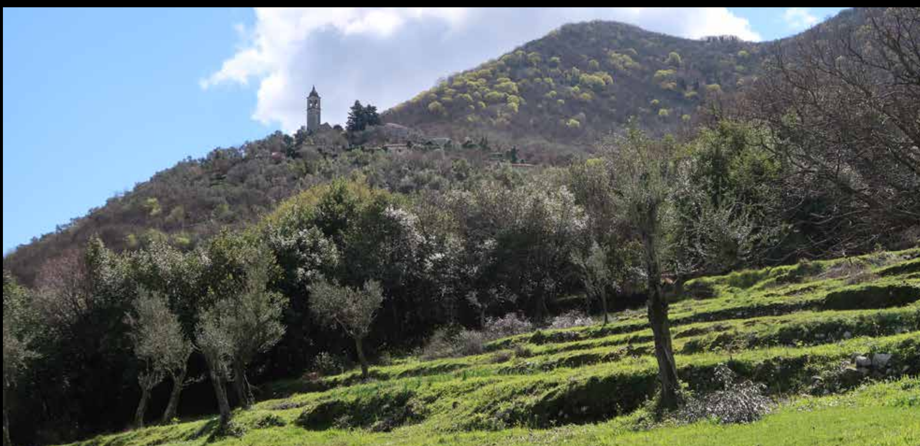
8 - Arable fields below Gorinji Stoliv