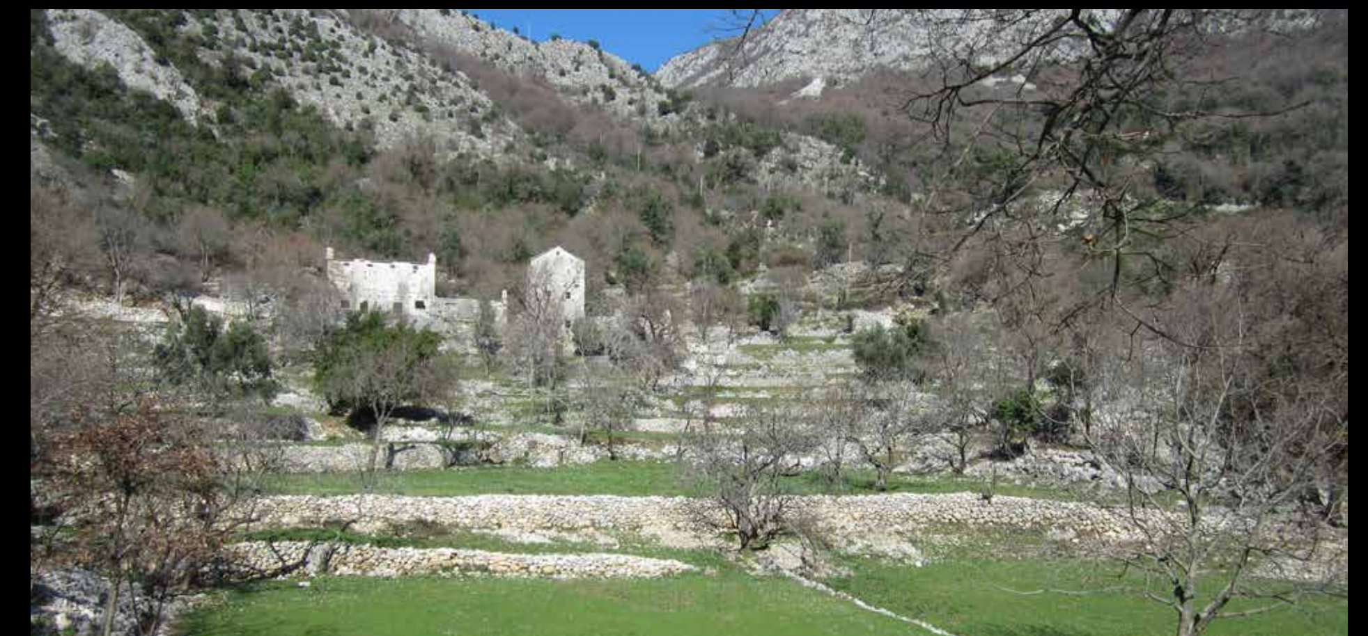
7 - Preserved terraced fields at Mala estate, Risan