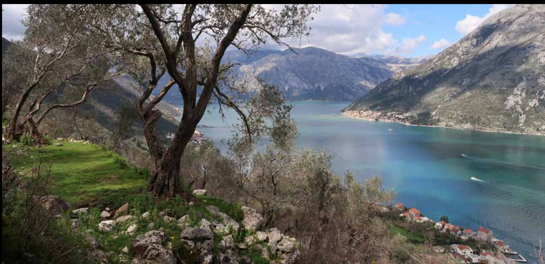
4 - Preserved terraced fields with olive groves, Gorinji Stoliv