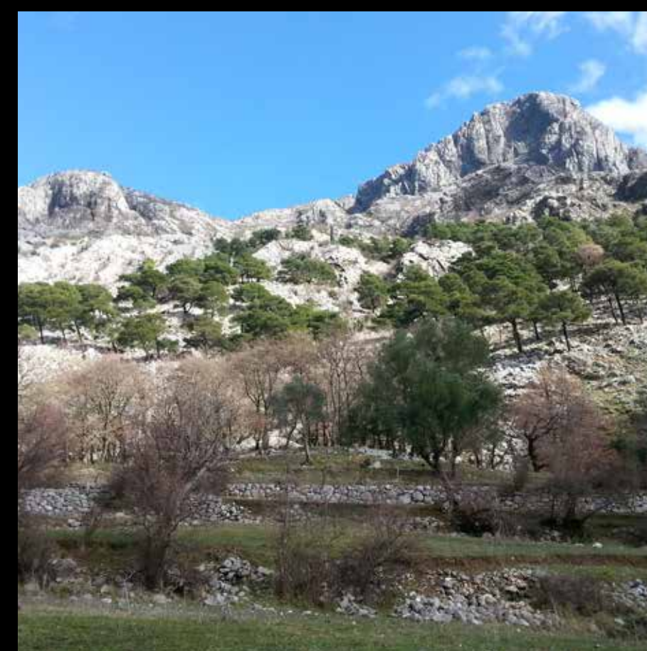
6 - The remains of terraced fields in the upper zone of Dobrota