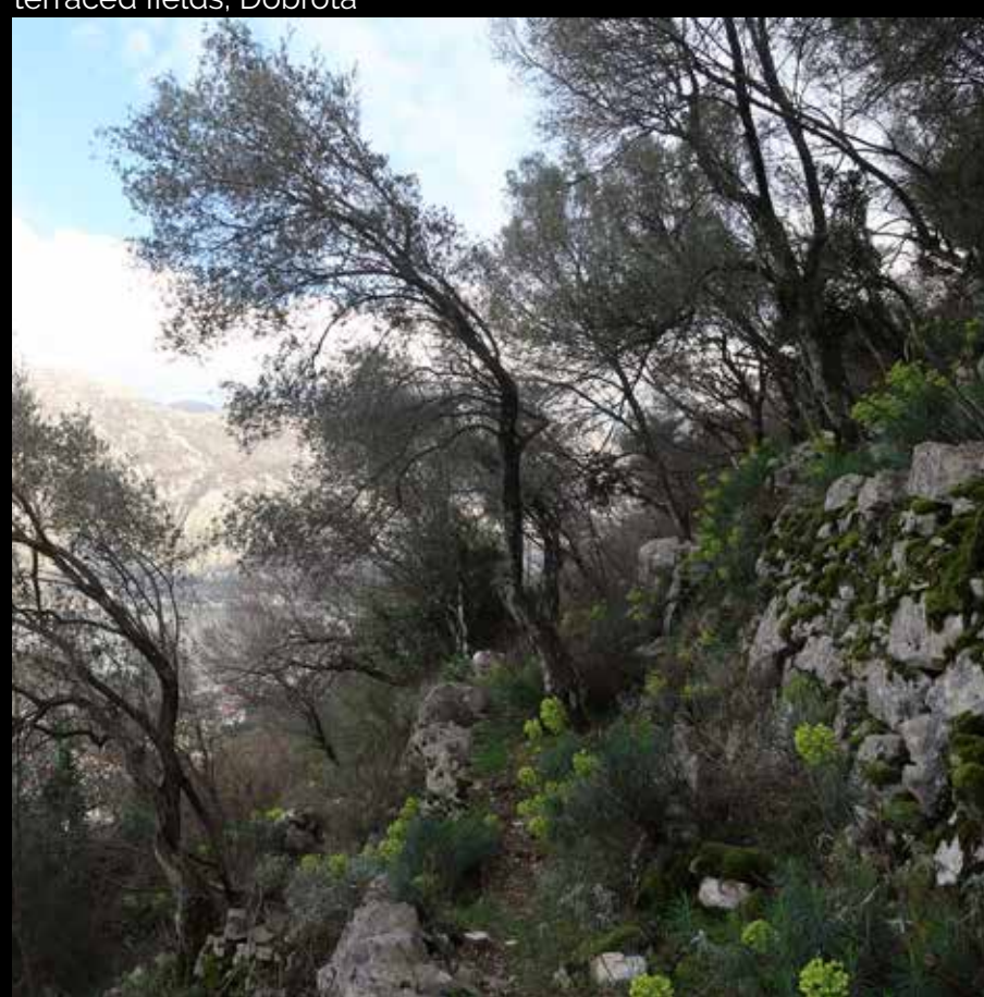
9 - Neglected, but preserved terraced fields with olive groves, Gorinji Stoliv